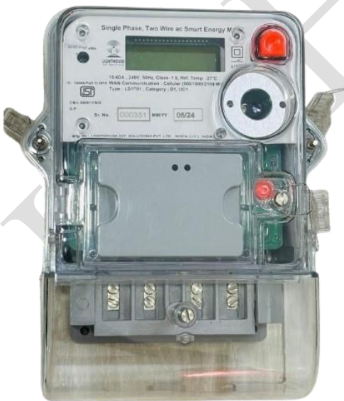
Single Phase Smart Energy Meter

With communications enabled, Edison meters create a reliable and robust network, which prevents electricity theft and also helps identify unexpected technical losses.